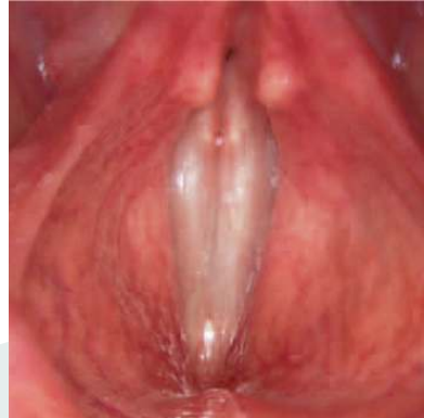
Normal vocal folds voicing